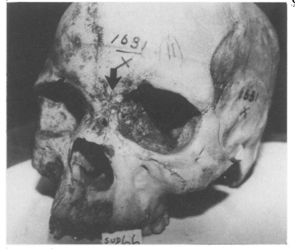
6. Fracture left nasal bone (arrowed). SUD 66. Mature probable male