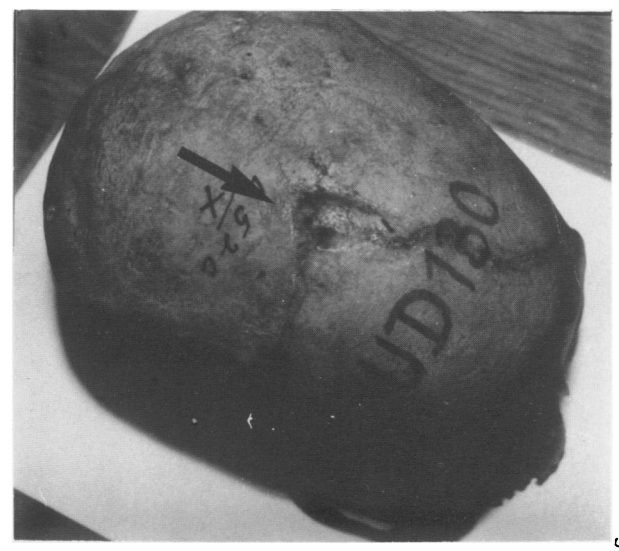
4. A kidney-shaped depression, posterior part of the mid frontal bone (arrowed). SUD 130. Elderly female