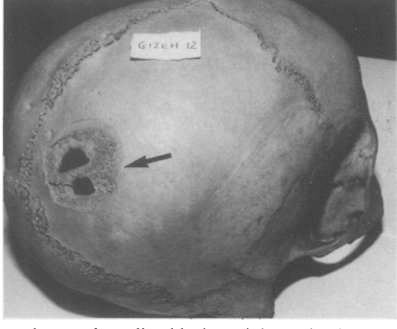
5. A complete sliced lesion, right parietal posterior position (arrowed). Giza 12 (E1085). Young adult male